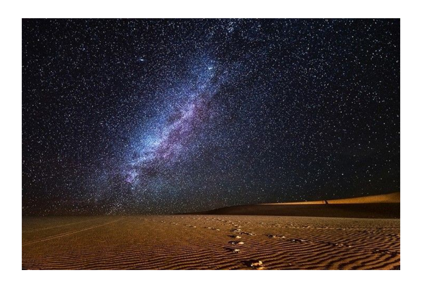
"Is this night a failure because it will end in an hour? Is the sun a failure because it's going to end in a billion years?"