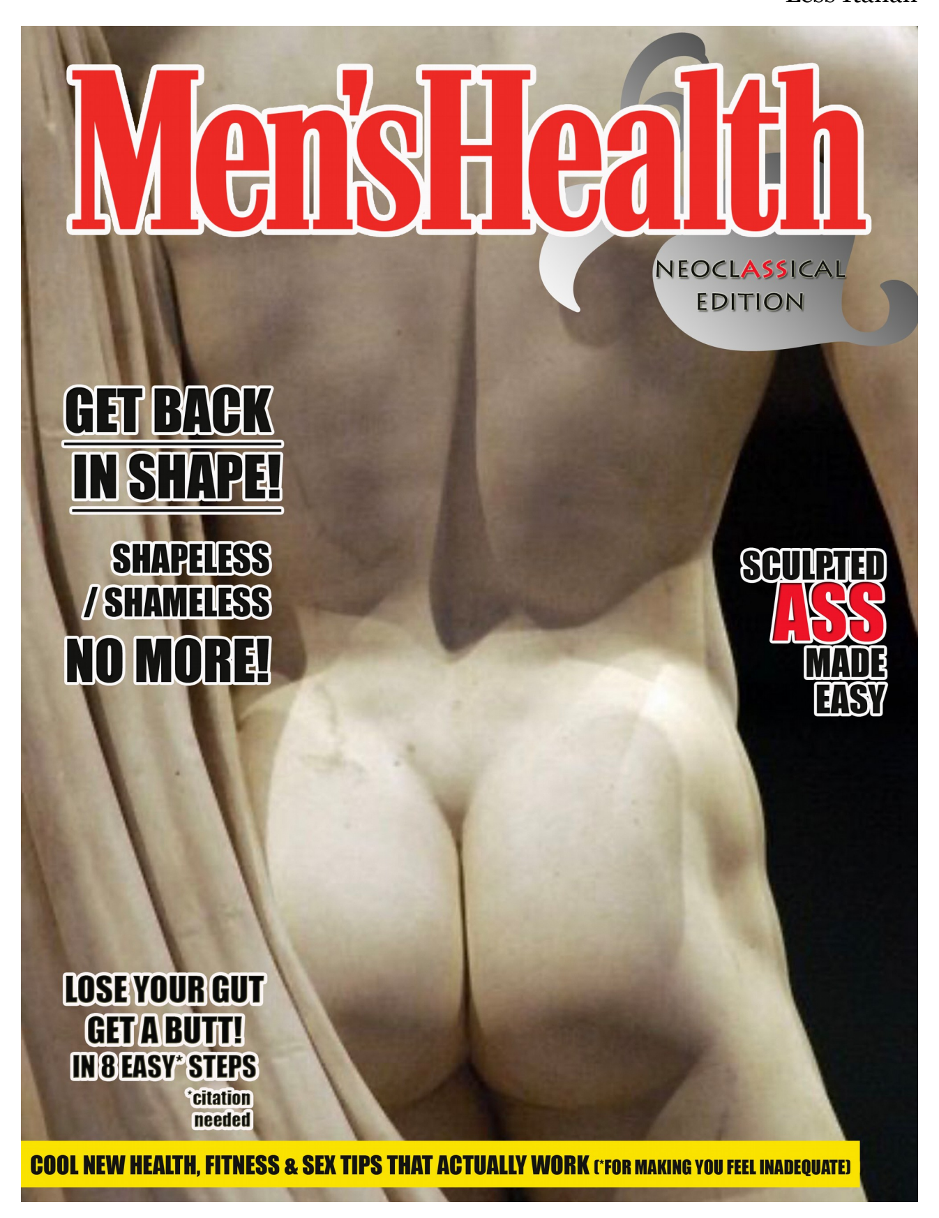
"in his mind he sees the horror of his middle-aged body and cannot bear the judgment"