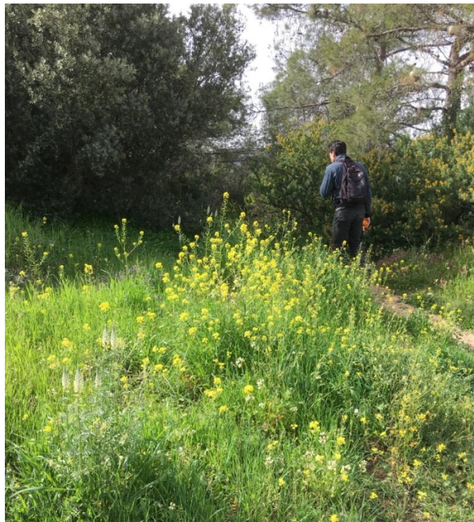
University Campus, Zografou